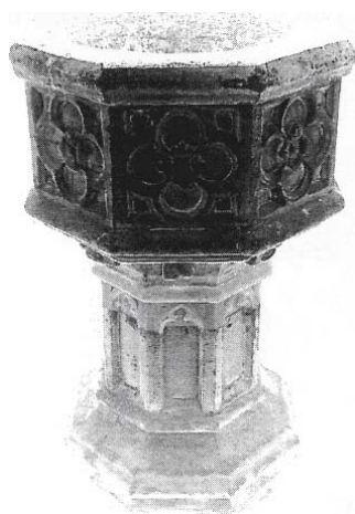
OUR 15th CENTURY FONT

There are various elements to the service. There will be hymns, readings, and a short sermon. There are some declarations and prayers at the