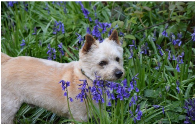
Photography Joint Winner Nigel Bird