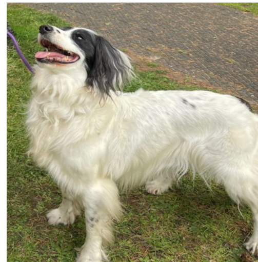
Dog Show Prettiest Bitch: JESS