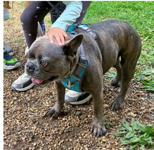
Most handsome dog & dog performing the best trick: ZEUS